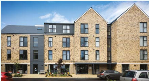
Colwell Road – Freshwater, Isle of Wight £10.3m Gross Dev Value (net of Grant) Extra care and shared ownership for over 55s, or over 45s with a support need 75 x 1- & 2-bed apartments c.110 people housed