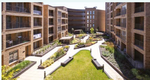
Sterling Gardens – Newbury, West Berkshire £23.0m Gross Dev Value (net of Grant) Social and Affordable rented and shared ownership homes 119 x 1- to 3-bed apartments c.320 people housed

Gross Dev Value (net of Grant): £152.2m 3 Total number of homes: 851 Potential number of residents: c.1,600