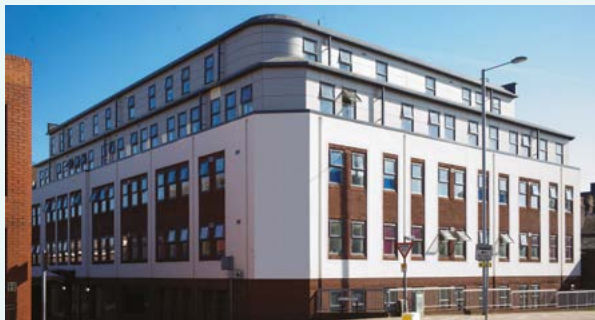
Midland House – Luton, Bedfordshire £9.6m Gross Dev Value Homelessness project 78 x 1- & 2-bed apartments 78 people housed