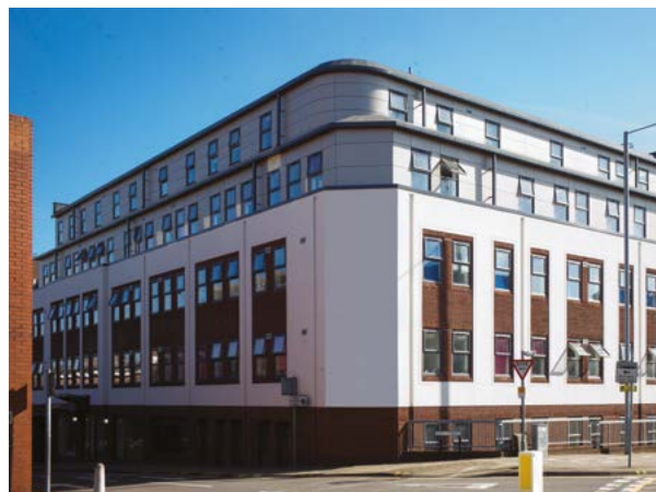
Midland House, Luton

Within the scheme, there are 36 shared cluster units, where two residents have their own bedroom and share a kitchen and bathroom, as well as six self-contained flats which are typically occupied by those almost ready to move into more permanent accommodation. Residents are typically permitted to reside at Midland House for up to two years. During that time, they have the option to attend various workshops, including advice on how to manage their finances and support in applying for long-term housing after they leave Midland House.