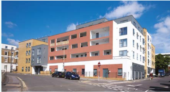
Birchett Road – Aldershot, Hampshire £9.1m Gross Dev Value (net of Grant) Social and Affordable rented and shared ownership homes 1 58 x 1- to 4-bed apartments and maisonettes c.120 people housed