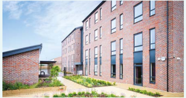
Balmoral Place – Northampton, Northamptonshire £17.8m Gross Dev Value Extra care for over 55s 80 x 1-bed apartments c.120 people housed