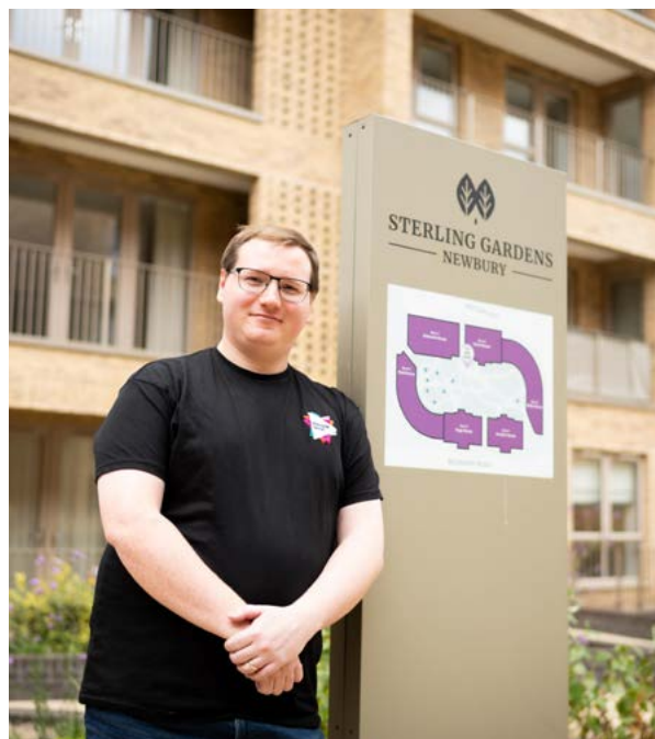
Scheme manager at Sterling Gardens, Newbury

We heard feedback that the scheme had experienced some issues with antisocial behaviour (ASB) in its early months. Although these problems have not been eliminated entirely, a new scheme manager started mid-2025, and since then, several residents remarked that there has been a marked improvement in the management of the scheme. ASB reports have fallen month-on-month, from a high of 16 in May, to 5 in August.