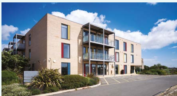
Beaumont House – Walton-on-the-Naze, Essex £12.5m Gross Dev Value (net of Grant) Extra care for over 55s 60 x 1- & 2-bed apartments c.90 people housed