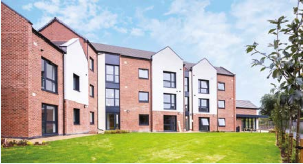
River Beal Court – Rochdale, Greater Manchester £5.5m Gross Dev Value (net of Grant) Supported living for individuals with a care need 37 x 1-bed apartments c.55 people housed