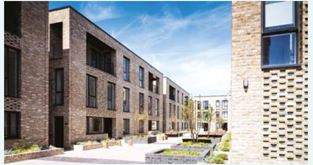
Island Point – Tower Hamlets, London £38.0m Gross Dev Value (net of Section 106 benefit) Social and Affordable rented and shared ownership homes 172 x 1- to 5-bed apartments and houses 2 c.450 people housed