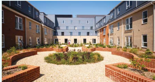
Ashey Road – Ryde, Isle of Wight £12.0m Gross Dev Value (net of Grant) Extra care and shared ownership for over 55s, or over 45s with a support need 27 x 2-bed bungalows, 75 x 1- & 2-bed apartments c.150 people housed