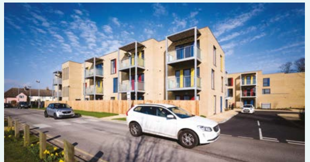
Rosebank Park – Harwich, Essex £14.4m Gross Dev Value (net of Grant) Extra care for over 55s 70 x 1- & 2-bed apartments c.105 people housed